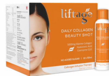
12 x 50ml